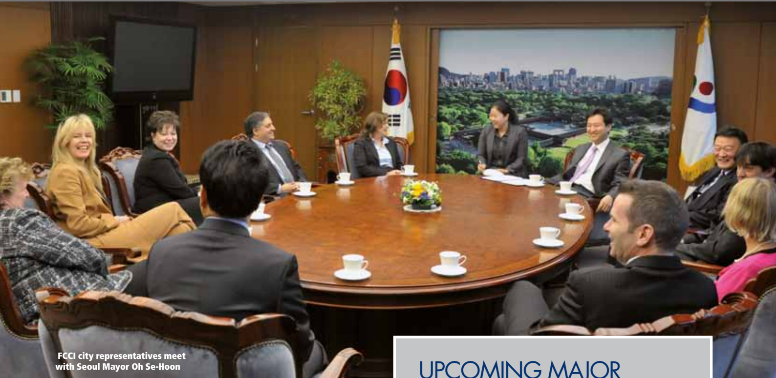
FCCI city representatives meet with Seoul Mayor Oh Se-Hoon