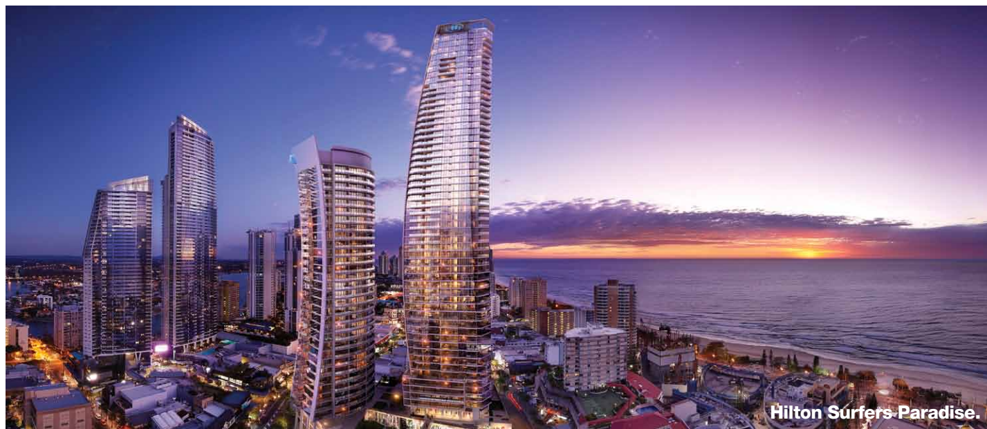
Hilton Surfers Paradise.